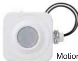
Motion sensor available option