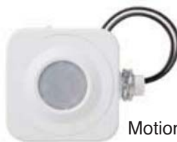
Motion sensor available option